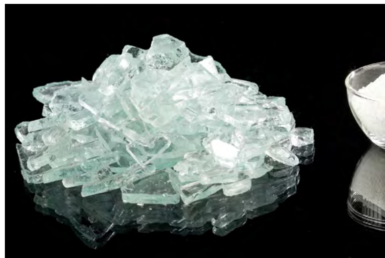
Raw material for glass production: Cullet, soda, quartz sand, dolomit, li